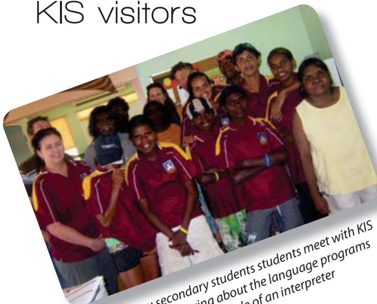
Kalumburu secondary students meet with KIS and Mirima, hearing about the language programs and about the role of an interpreter