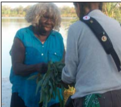
Mantha— traditional water welcome to country for the visitors

language—working together at home, around the community or wherever they want, carrying out everyday activities together.