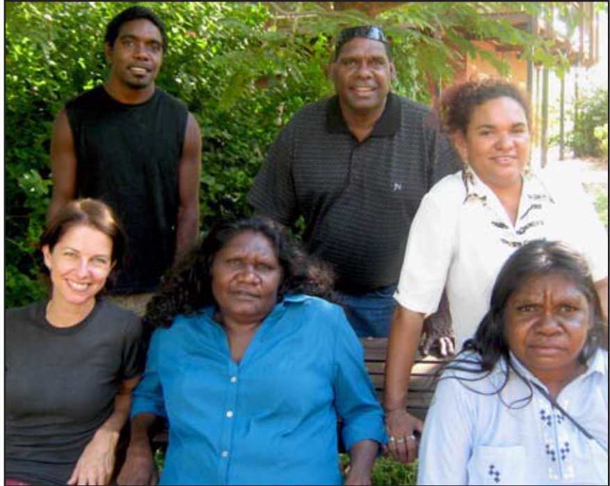
Bilingual course attendees:

KIS recommends this course for all Aboriginal Liaison Officers throughout the Kimberley.