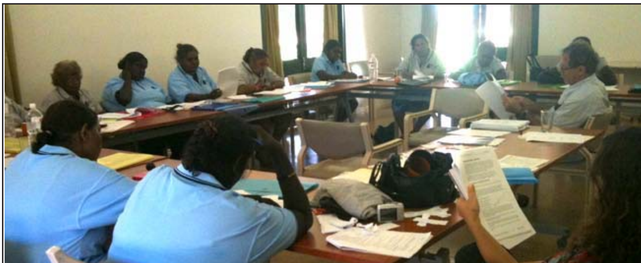
Diploma of Interpreting students hard at work

24 interpreters enrolled for the Diploma, with 6 withdrawing before the start.