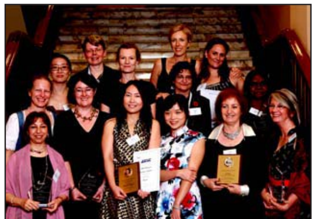
Below: All the trophy winners