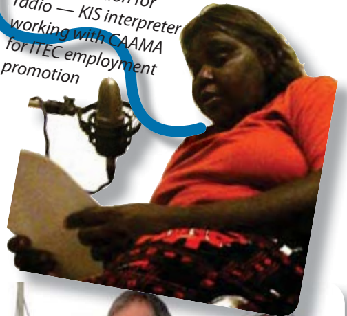
Jaru translation for radio — KIS interpreter working with CAAMA for ITEC employment promotion